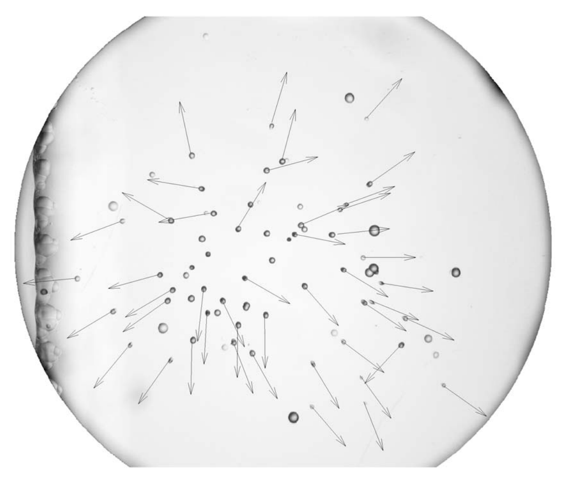
Figure 3. Shower of etch pits on a detector chip supported in air under a nickel cathode. The width of the image is approximately 2mm. Arrows indicate the directions in which charged particles impinged on the chip. The electrolyte was \text{Li}_2\text{SO}_4 in \text{H}_2\text{O} . (The virgin chip was etched before beginning the experiment to reveal pre-existing particle tracks. During the following etch they grew to twice the diameter of the experimental pits and can be distinguished by their large size.)

Figure 3 shows one of the small showers observed by Oriani [17]. In obtaining this shower he employed an electrolysis cell in which the electrolyte is contained within a vertically oriented glass tube and the cathode is a thin sheet of nickel that closes the bottom of the tube and provides a watertight seal. The upper cathode surface is in contact with the electrolyte and the lower surface is in contact with air. The shower was recorded on a CR39 plastic detector placed in air under the cathode. To understand how this may have occurred I note that polyneutrons that enter the cathode from the electrolyte shrink in interactions with nickel. The most exothermic reaction involves <sup>58</sup>Ni (68%),